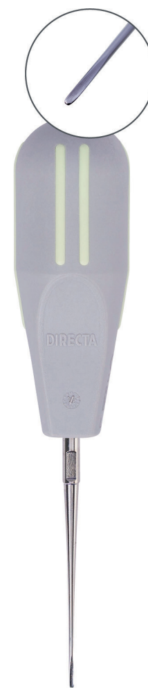
L1S Periotome 1 mm Straight Standard