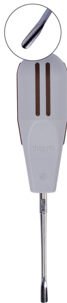
L5C Periotome 5 mm Curved Standard