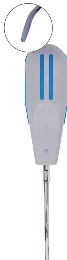
L3CA Periotome 3 mm Contra Standard