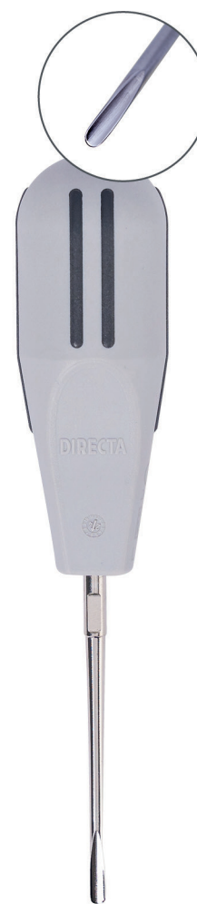
L3S Periotome 3 mm Straight Standard