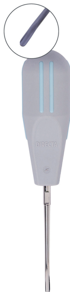
L3IC Periotome 3 mm Inverted Standard