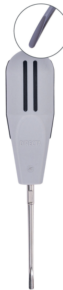
L3C Periotome 3 mm Curved Standard