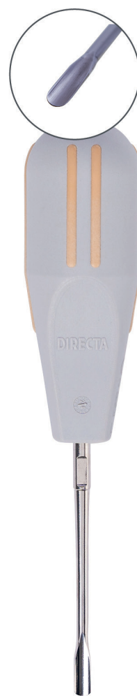
L5S Periotome 5 mm Straight Standard