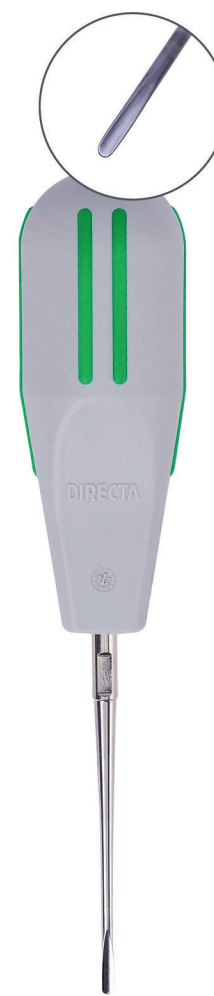
L2S Periotome 2 mm Straight Standard